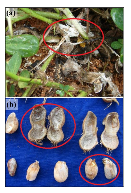
Fig. 1. a) Mycelium covering plant stems near the soil surface. b) Mycelium invading pods causing rotting of tissues

and Siddaramaiah et al. 1979[15] observed foot rot symptoms accompanied by girdling of younger plants and later such plants were succumbed to death. Mehrotra and Aneja, 1990[16] noticed the cortical decay of stem base at ground level and appearance of conspicuous white mycelium which extended into the soil and on organic debris. Symptoms of southern stem rot include wilting of individual stems, stem lesions, shredded stems and pegs, rotted pods, and plant death.