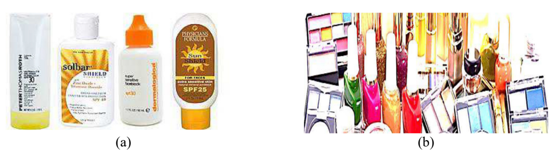
Fig. 1. Nanocosmetics [16]. (a) http://tinaounds2016.blogspot.in, and, (b) https://www.nanotechia.org

materials. These wet wipes are infused with nano emulsions [20]. Skin permeability is significantly influenced by emulsion composition, globule charge, and surfactants [21]. Skin naturally contains lipids including palmitic acid and ceramide 3. It has been proven that including these lipids and cholesterol greatly improves the skin's moisture and suppleness. The convention of nano emulsions in cosmetic products has expanded due to their small particle sizes, which will undoubtedly aid in improving skin penetration, hydration, fluidity, and a glossy coating on the skin as well as the infiltration of active chemicals via the skin. Nano emulsions enhances penetration even more [22].